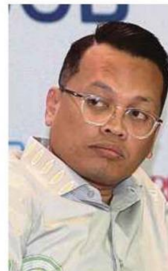
Natural Resources, Environment and Climate Change Minister Nazmi Nik Ahmad says ministry has conducted engagements with state governments on climate change.

“Organisations such as UMW Holdings Bhd, Yayasan Axiata &